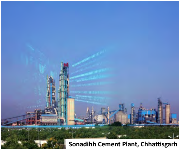
Sonadihh Cement Plant, Chhattisgarh