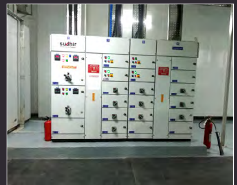
7nos. x 2000 kVA Gensets with complete Synchronization panel