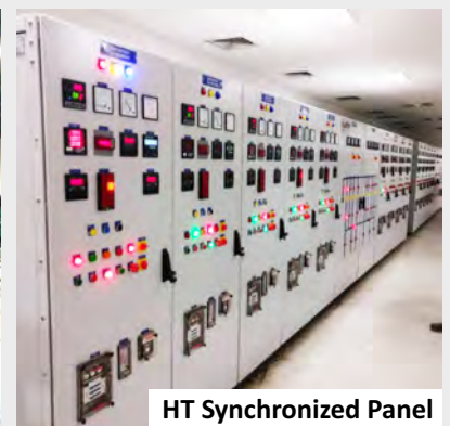
HT Synchronized Panel