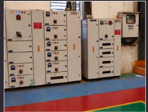
415V DG PLC based Synchronization panel, Capacitor panel, LT & Distribution panel installed at Krishna Maruti