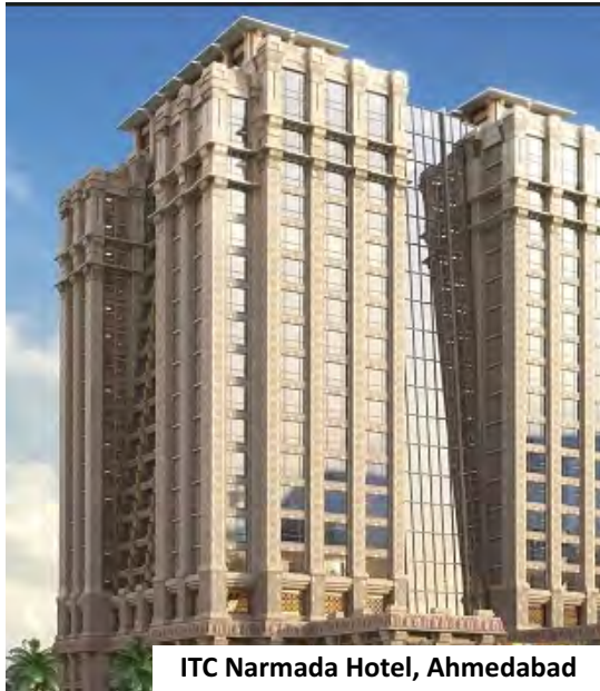
ITC Narmada Hotel, Ahmedabad