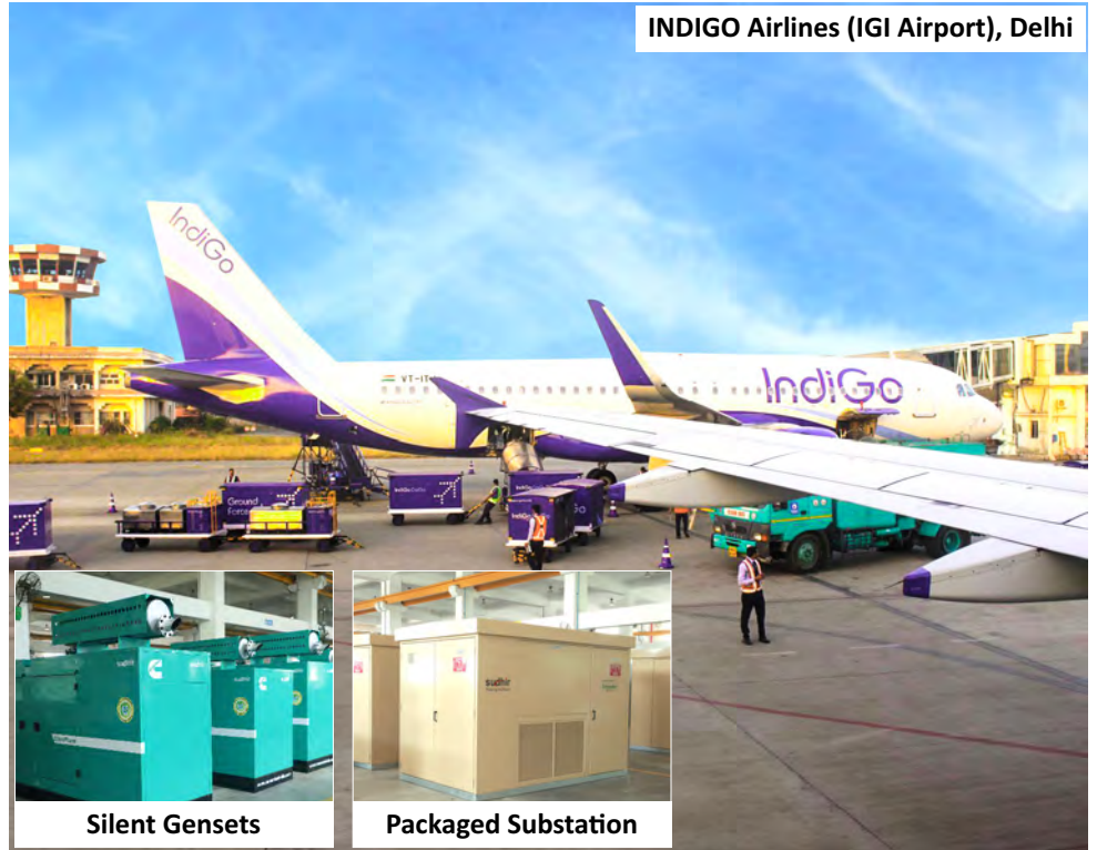
INDIGO Airlines (IGI Airport), Delhi

For upcoming ITC project Narmada Hotels Ltd. at Ahmedabad, Sudhir will provide complete EPC for the power house in terms of cabling, exhaust piping work, fuel piping, earthing and sound proofing of DG Room which reduces the noise to meet CPCB norms. The scope also includes installation, testing and commissioning of Gensets 2 x 1500 kVA. Located in largest city and former capital of the Indian state of Gujarat, Ahmedabad, the hotel will comprise of 294 guest rooms & suites with lavish accommodation, the hotel will feature a range of facilities to meet your needs – from state-of-the-art meeting, banquet and conference spaces to exceptional repertoire of culinary excellence.