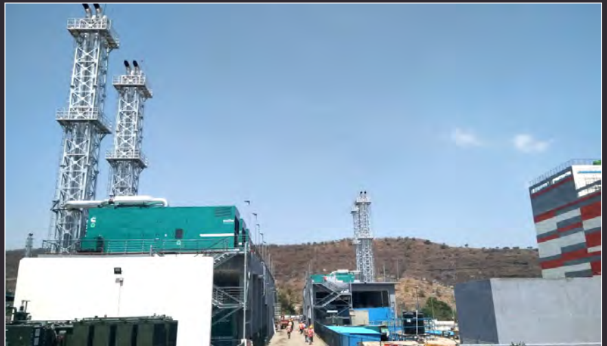
14 nos.x 2250 kVA Gensets with 11 kV Synchronized panel installed at Nextra Data centre