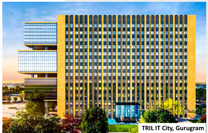
TRIL IT City, Gurugram

Tata Realty and Infrastructure Limited (TRIL), subsidiary of Tata Sons, and serves as a real estate and infrastructure development arm of the group entrusted Sudhir for a complete power solution. Sudhir will execute complete order of SITC design & build of 2 x 2000 kVA Gensets with HT synchronized panel, exhaust piping, cabling, earthing bulk storage HSD tank, acoustic room control cabling, chimney etc.