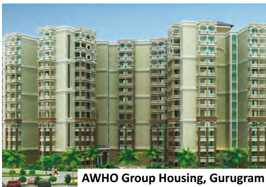
AWHO Group Housing, Gurugram