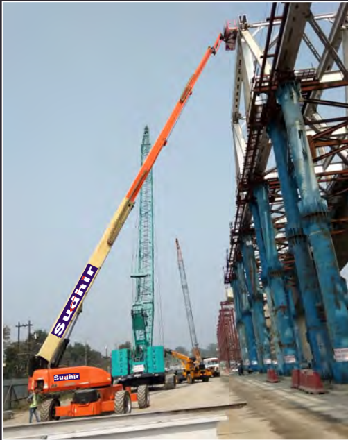
2 nos. 135 ft. Self Propelled boom lift hired for constructing 5km long bridge