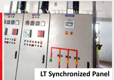
LT Synchronized Panel